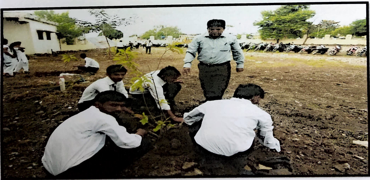
Tree plantation in the campus of SSBES' ITM